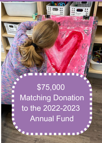
$75,000 Matching Donation to the 2022-2023 Annual Fund