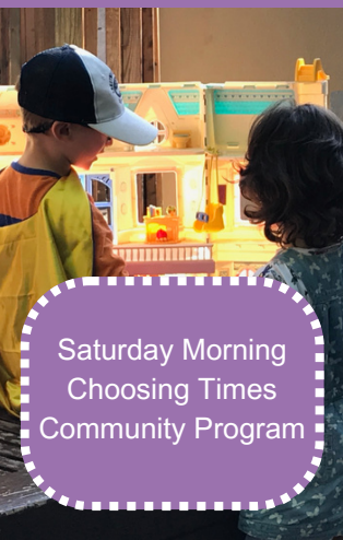
Saturday Morning Choosing Times Community Program