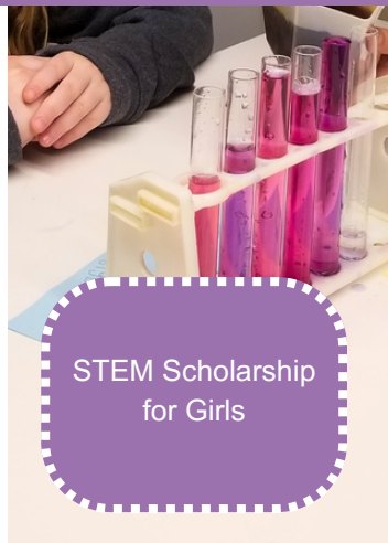
STEM Scholarship for Girls